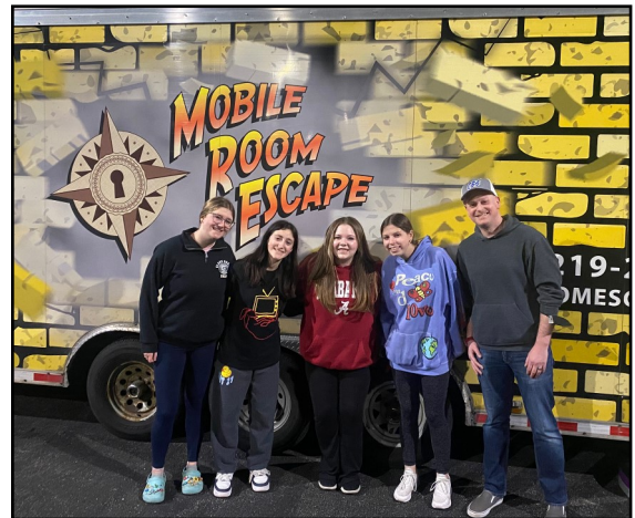
USY Escape Room