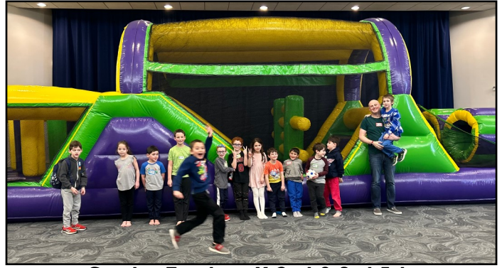
Sunday Funday - K-2nd & 3rd-5th