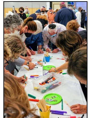
Community In Unity With Highland Park @ CBS