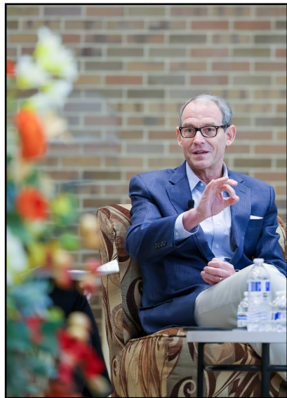
Distinguished Speaker Daniel Silva