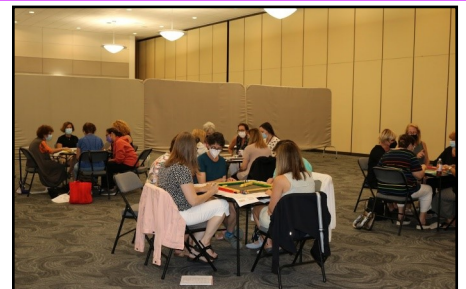
Sisterhood Game Day Learning Sessions